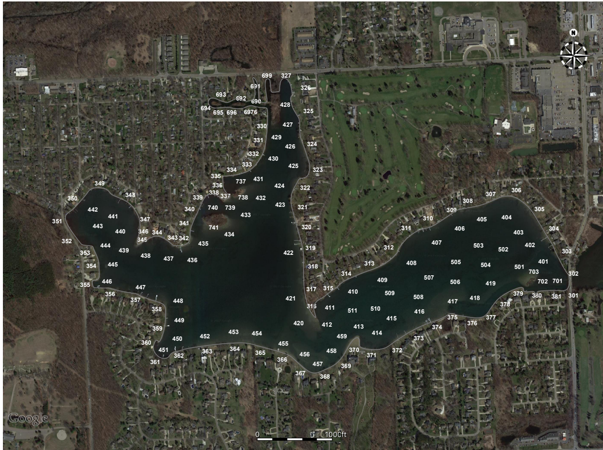
Figure 1. Lower Straits Lake AROS map.

Starry stonewort and late season growth of ebrid watermilfoil can emerge at nuisance level in late July. Species selective treatment is generally recommended. However, mechanical harvesting may also be used to manage nuisance growth that may emerge in late summer. The management plan shall be reconsidered in mid to late July prior to the assignment of any herbicide application or harvesting areas. The use of harvesting is also contingent on contractor availability, cost, and the nuisance species present during late summer.